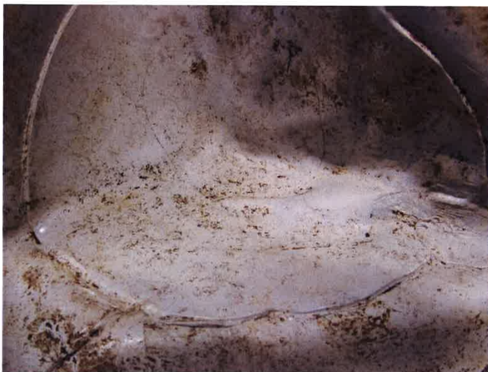
Figure 3: Membrane surface with wall corner made by an internal corner.