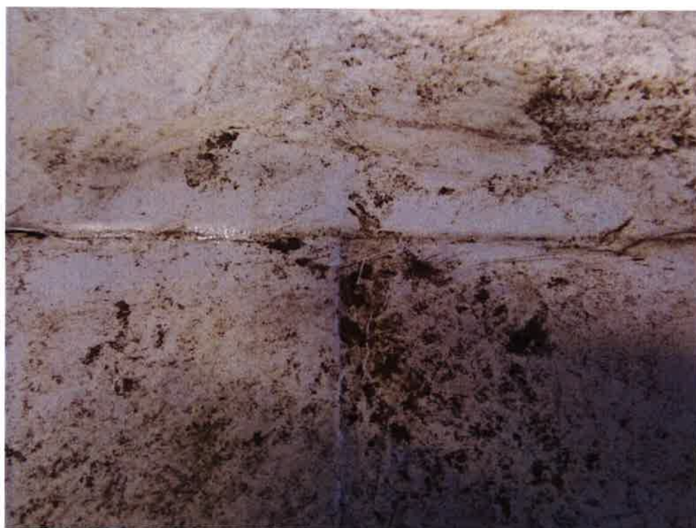
Figure 2: Membrane surface with T-joint