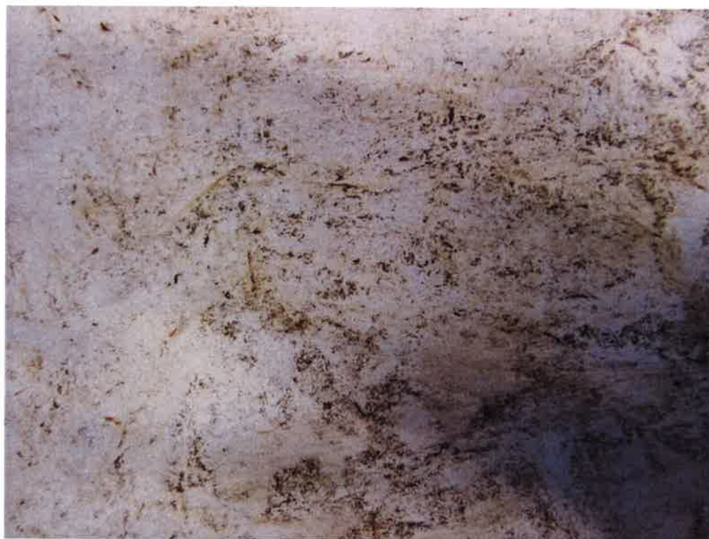
Figure 1: Membrane surface